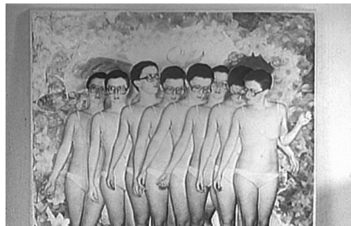
Cindy Sherman Still from Doll Clothes , 1975 16mm film transferred to DVD; 2 minutes 22 seconds

The exhibition gathers over 25 works of recent art to show the full extent of this practice, displaying them in juxtaposition with historical animations, some dating back to the early twentieth century. Hiraki Sawa, for example, uses the model of the flip book as the template for the action of his video. The vaudevillian lightning sketch and the stop motion animation technique of early Edison Manufacturing Company films appear as a compelling analogy to works by Oscar Muñoz and Robin Rhode. Shadow puppetry films, popularized by Lotte Reiniger's 1926 film, the Adventures of Prince Achmed , offer Kara Walker's silhouette technique a powerful historical antecedent. In so doing, this Biennial will look at contemporary art developments through a bifocal lens, with an eye to both cultural history connected to the evolution of the moving image, as well as to that of contemporary art.